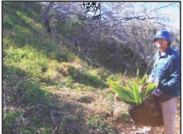
After shot: The Mother-in-Law Tongue has been dug out and bagged. Unfortunately there is still more in this area. June 2007