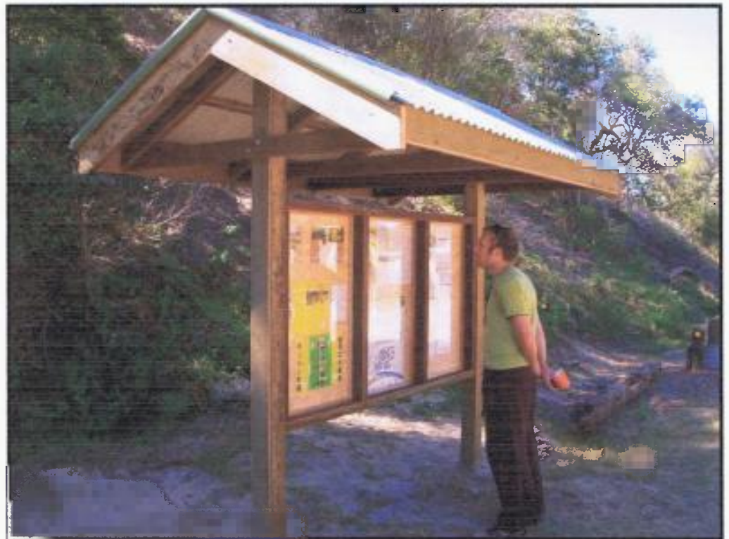
The weed information shelter at the Happy Valley township. August 2007.