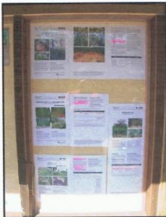
Highlighting the simplest control measures of Mother of Millions on a NRM Weeds Fact Sheet. August 2007.