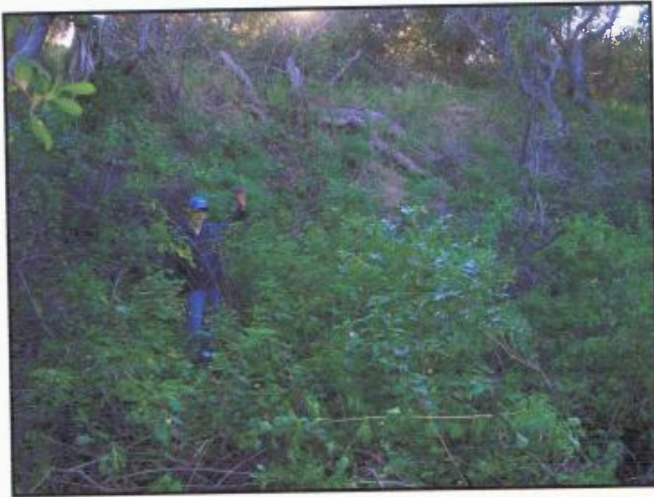
Before shot: Will standing in the middle of area nicknamed 'Cassia Gully' due to the large amount of Easter Cassia and Lantana stems in the area. This is in Area 1. July 2007